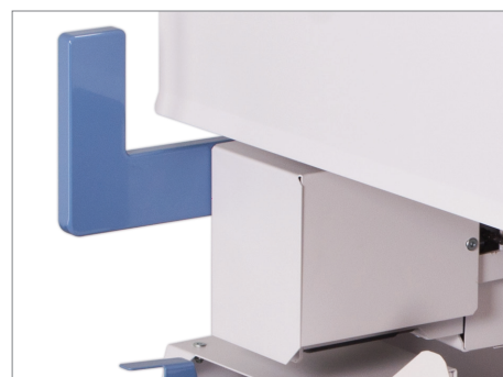
New PGO Microcut Roughener