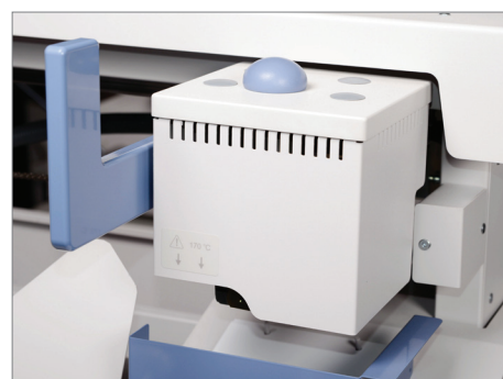
Easy and safe glue application

Product information as of January 2018 and is subject to change without prior notice.